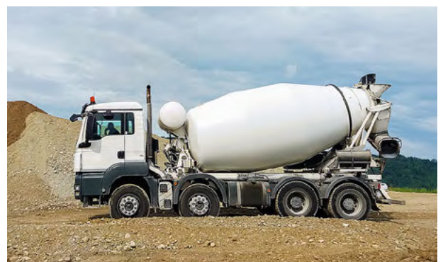
Primary use in agricultural wearing parts: Harrow and hollow disks, plow-shares, knives and chippers. In non-hardened condition, TBL® is suitable for moderate stresses, e.g. concrete mixer drums.

Because light should be easy: our service.